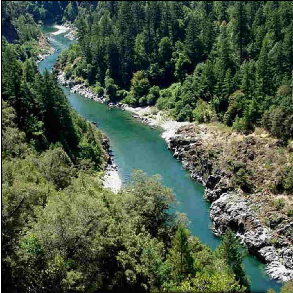
Trinity River, Willow Creek.