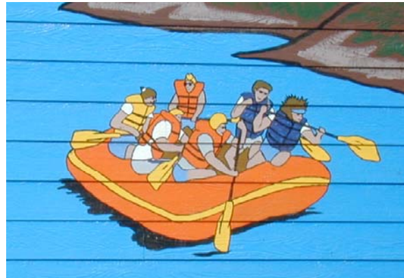
Downtown mural of rafters on the Trinity River