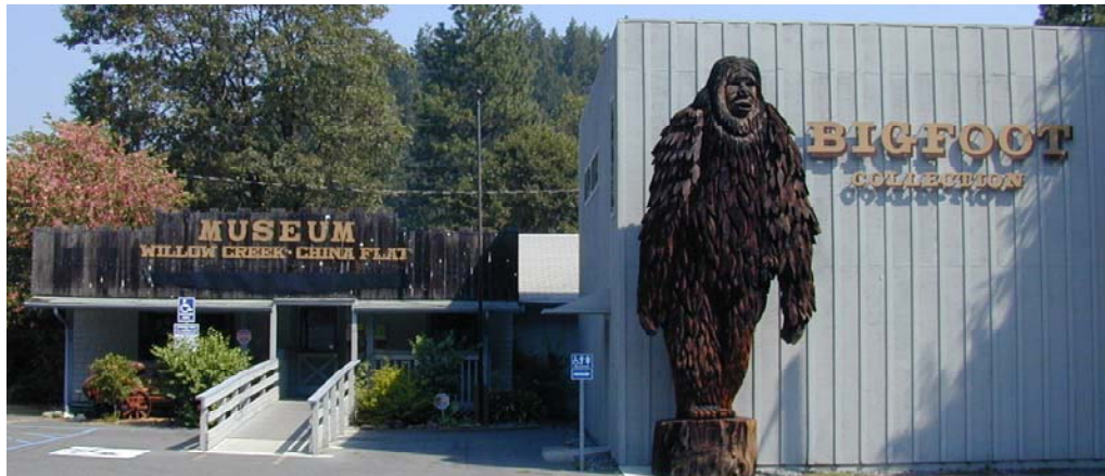
China Flat Museum with new Bigfoot annex