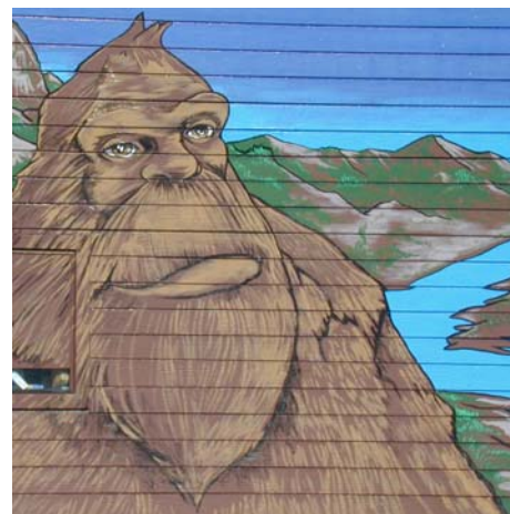
Downtown mural of Bigfoot

Willow Creek is also known as the “Gateway to Bigfoot Country “ reflective of the town’s adoption of the elusive creature as a major icon. The town has an appeal to tourists seeking Bigfoot stories and artifacts. There is now an entire annex of the local China Flat Museum dedicated to Bigfoot, attracting visitors from