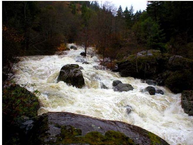
Planned location of water diversion from Willow Creek

A cooperatively owned hydroelectric power generation facility was identified as a priority project in the 1997 Community Action plan. Rock Power Partners (Big Rock) continues to work on plans for the development of a small hydroelectric power system on Willow Creek. The system would divert only a portion of the winter and spring runoff from the creek for a distance of less than 2000 feet before returning the water to the