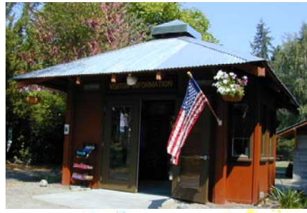
Gateway Information Center

The WCCSD received $7,500.00 from the County of Humboldt in 2001 as seed money for a new Visitor Information Center. The community raised an additional $10,000.00 to help complete the new Information Center. The facility is 16' x 12' and mimics in style a mountaintop fire lookout station.