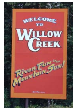
Welcome sign at the east end of town

During the 1999-2000 fiscal year Willow Creek received funding from the USFS Rural Community Assistance Program to promote the attractive features of the community. The funds were used to create and distribute a community brochure highlighting attractions and activities in the local area, build a community website, and construct a welcome sign at the eastern entrance of town.