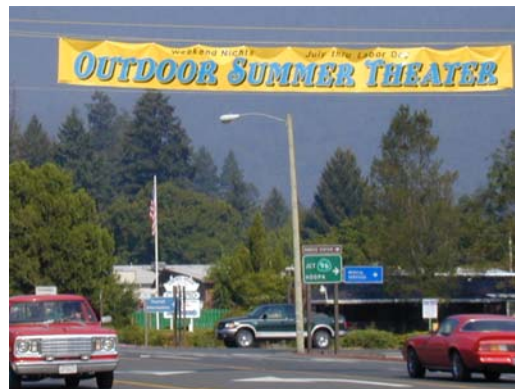
Highway banner announcing a theater production