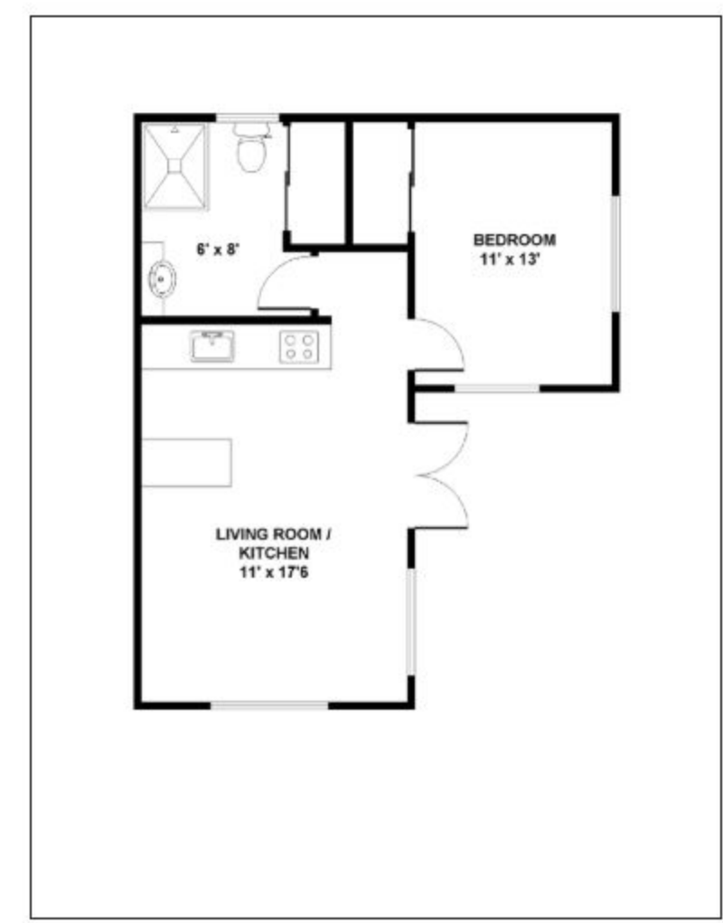
A Just-Right Backyard Cottage 496 sq ft