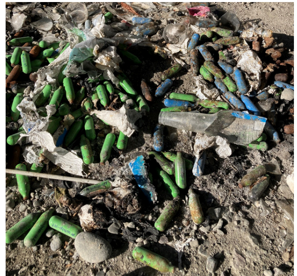
Nitrous oxide “whippet” canister litter found at the mouth of the Van Duzen River near Alton.

In January 2024, the Board of Supervisors directed the DHHS-Public Health Branch to address retail sales of recreational nitrous oxide through education and policy approaches. In June 2024, Public Health’s Substance Use Prevention program was awarded funding from the Department of Health Care Services Substance Use Block Grant Primary Prevention Services grant to work on recreational nitrous oxide education and prevention activities throughout Humboldt County from 2024 through 2028.