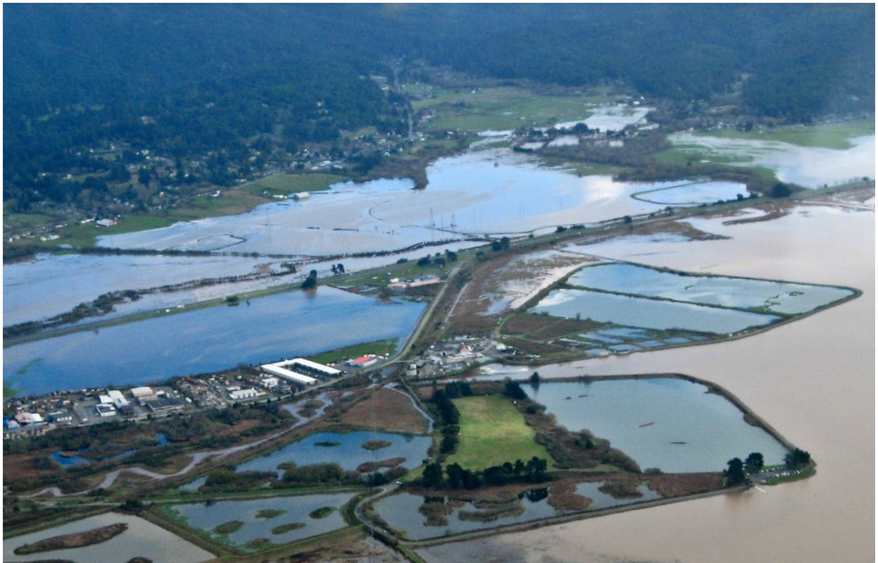
Figure 7. December 2, 2012 – Looking east from Arcata marsh towards inundated Arcata Baylands (Brad Finney).