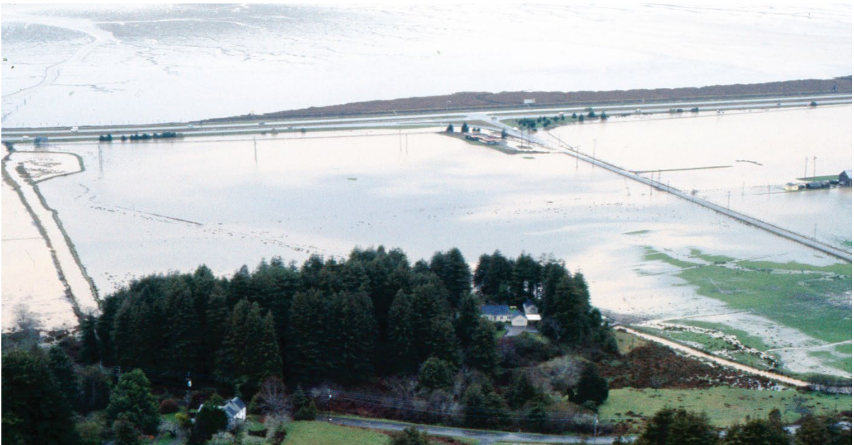
Figure 4. March 18, 1975 – Washington Gulch, Bayside Cutoff, and US 101.