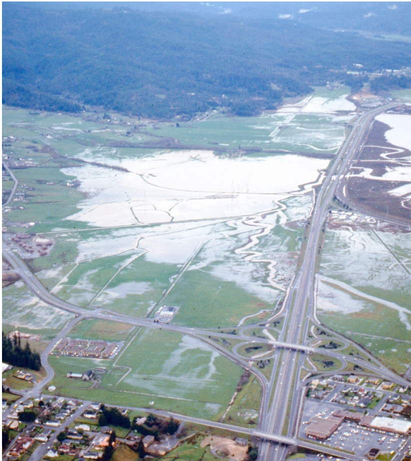
Figure 2. January 16, 1974 – Arcata Baylands, US 101 a and Samoa Blvd/OAR (Humboldt County Dept. of Public Works).