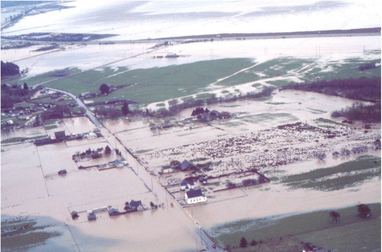
Figure 3. March 18, 1975 – OAR crossing Jacoby Creek valley.