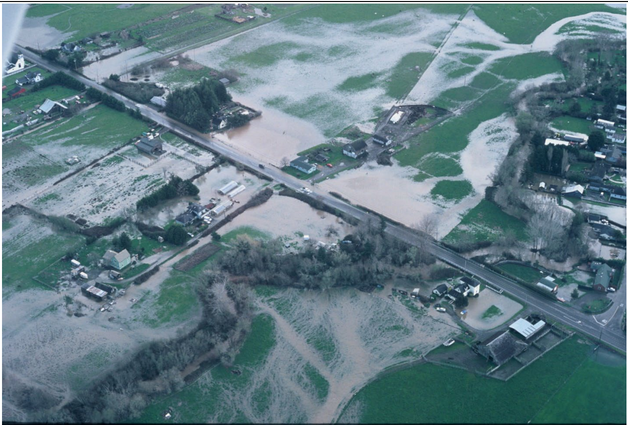
Figure 6. February 18, 2004 – Old Arcata Road at Jacoby Creek Bridge, facing east. (Humboldt County Dept. of Public Works).