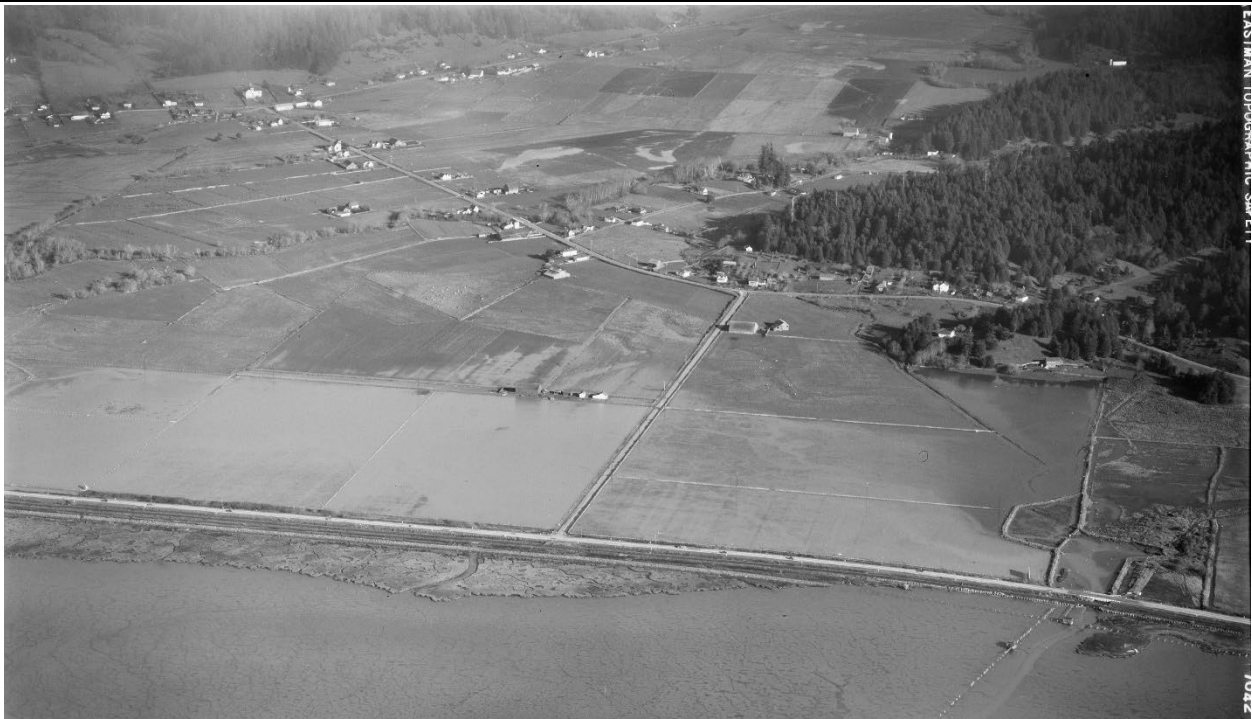
Figure 1. January 8, 1948.