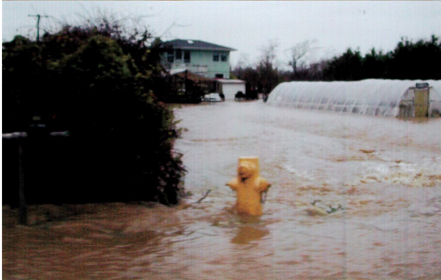
1/1/2003 Figure 5. January 1, 2003 – Photos of flooding across Old Arcata Road and onto properties to the west, taken from Kokte Ranch driveway.