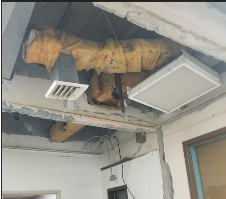
Ceiling in Sheriff's Office corridor in need of immediate repair.